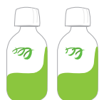
Two bottles of CLENPIQ (5.8 oz each)