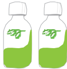
Two bottles of CLENPIQ (5.4 oz each)